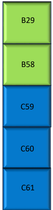
EXHIBIT FLOOR PLAN